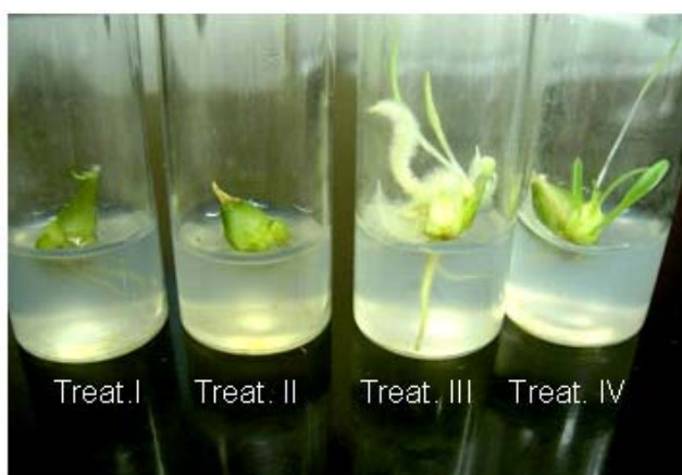
Figure 1. Bulblets, leaves and roots differentiation in micro scales from L. alexandrae . Treatments: I (MS), II (MS + EP), III (MS + NAA) and IV (MS + BWE), at day 50.

At day 50 (Figure 1) S. hofmanni BWE increased the number of bulblets per explant by 27% comparing with MS, representing this increment 78% of the bulblets produced by NAA. At day 70 the increment was 21 y 32% for EP and BWE, respectively, compared to MS. With respect to NAA, EP produced 78% and BWE 83% of the number obtained with the synthetic auxin (Figure 2a). No matter higher the number of bulblets produced by NAA, cyanobacterial intracellular products increased the number of bulblets thicker than 5 mm as at day 70 BWE surpassed NAA, MS and EP effect by nearly 30% (Figure 2b). This effect on thickness is important to survival of the bulblets. The number of roots per explant (Figure 2c) in MS and EP was lesser than NAA by 70% and in BWE by 50%, at day 70. This could mean that BWE favoured the higher thickness of the bulblets, compared to NAA, at the expense